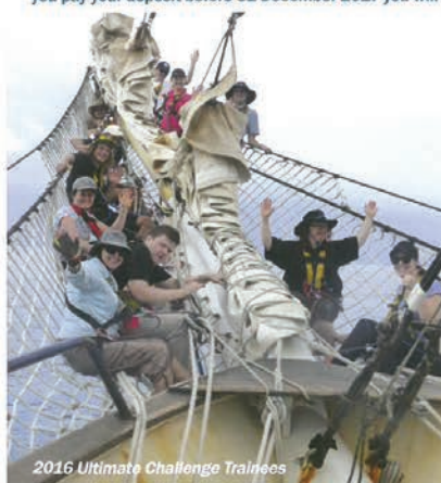
2016 Ultimate Challenge Trainees

*Please note: The 2018 Voyage fare has not yet been determined. Voyage fares will increase in 2018, however if you pay your deposit before 31 December 2017 you will pay the 2017 fare. Dates subject to minor amendments.