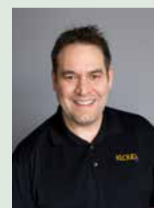
This monthly publication provided courtesy of Trent Milliron, CEO of Kloud9 IT.