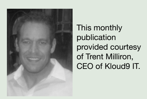
This monthly publication provided courtesy of Trent Milliron, CEO of Kloud9 IT.