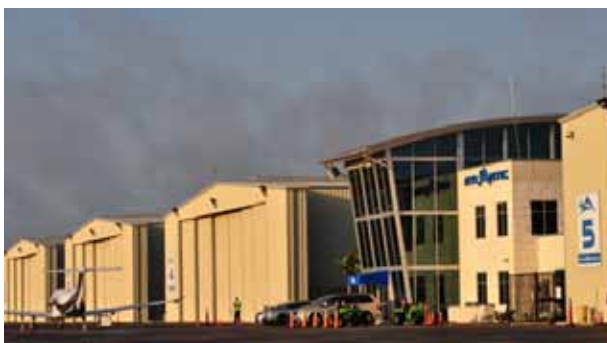
Atlantic Aviation operates the largest network of fixed base operations (FBOs) within the United States.

Across its nationwide network of 65 fixed based operations (FBOs), the company had installed legacy Wi-Fi equipment using standard reference designs and omni-directional antenna systems that simply couldn't keep up with an increasing number of concurrent wireless connections and RF interference, which only exacerbated flaky Wi-Fi connectivity. At many of these FBOs, broadband circuits were unavailable, so the legacy Wi-Fi system integrated support for cellular data services (3G) to backhaul traffic. But as traffic, clients, devices, and interference increased — this model didn't scale.