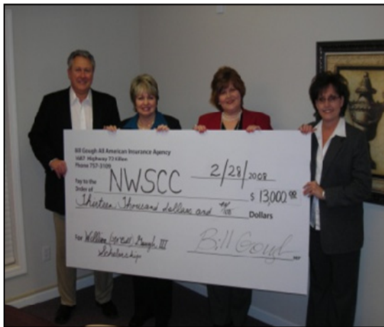
This was the first & largest one time amount made to the William M. "Bill" Gough III Memorial Scholarship at North West Shoals Community College