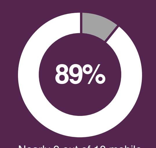
Nearly 9 out of 10 mobile devices are connected to corporate networks.

1 in 3 employees is completely mobile (no office).