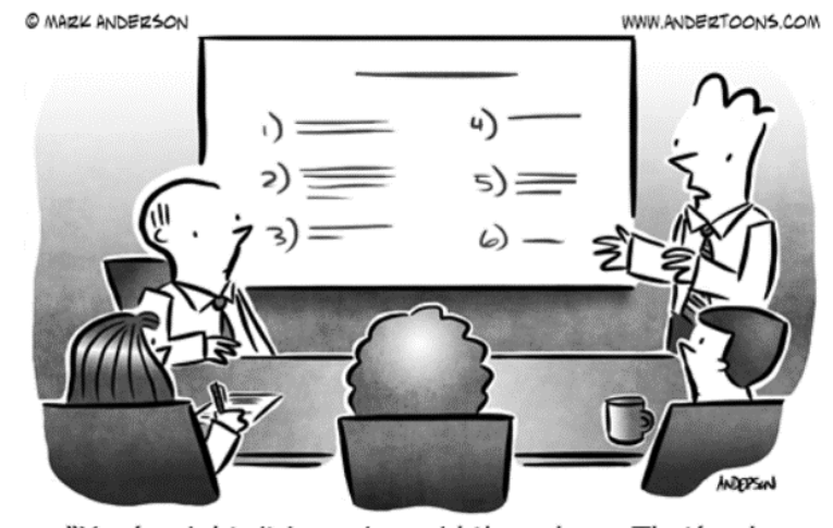
"You're right, it is easier said than done. That's why I said it; because it's easy. Try and keep up."

The hovering camera is the product by AirSelfie Holdings, an international team of developers and engineers, and is designed from the ground up to integrate seamlessly with your phone. To use it, all you do is slip it out from its charging case (which attaches directly to your smartphone), use the app to direct it to the desired height and orientation, and snap an aerial picture or video. The tech is available now, and with a $320 price tag, comparable to many other modern cameras. Check it out at AirSelfieCamera.com.