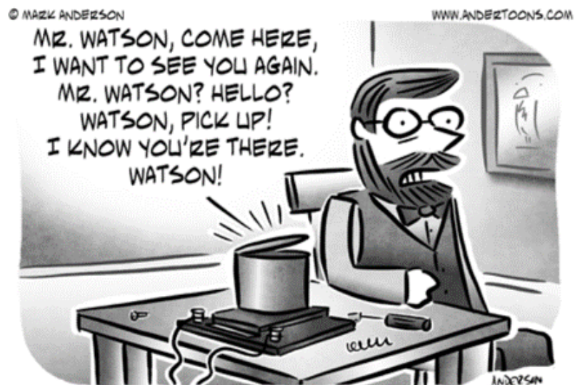
The telephone - day two.