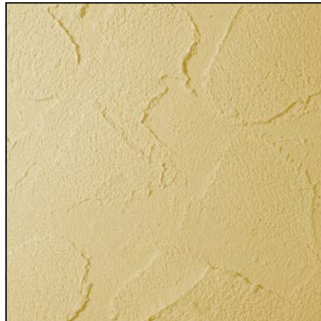
Refinish Texture (varied texture)

Also Available Perfect West (Payson Plant) Perfect Fine Spray Fine Refinish Fine Plaster-flex Aggrelime