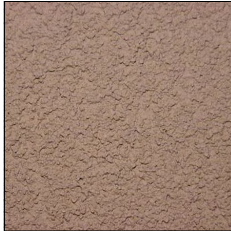
Desert Sand Texture