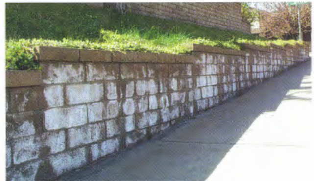
Figure 1. Typical white efflorescent salts on brick and block masonry