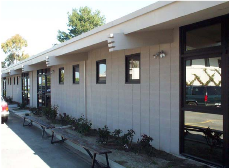
Figure 3. Overhanging eaves will help greatly to prevent moisture from entering this stack bond CMU wall.