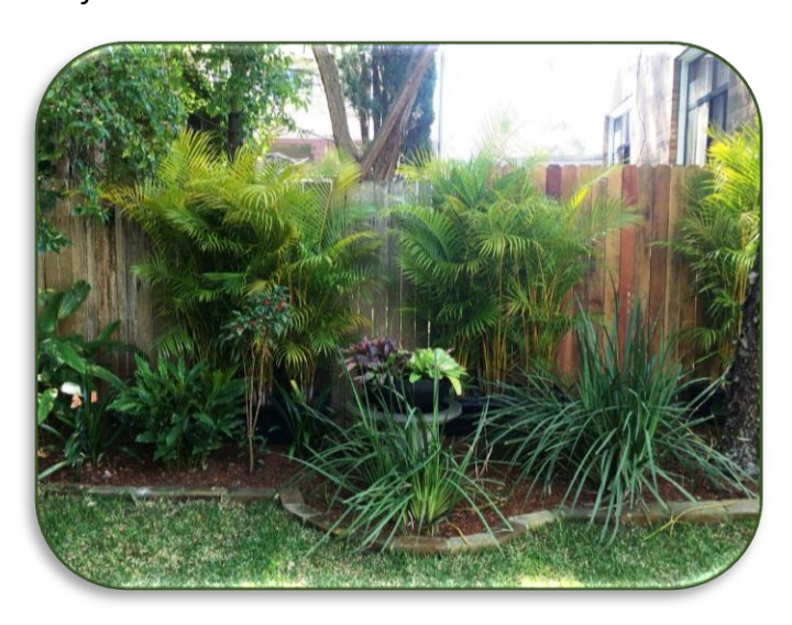
New lawn + Cleared, weeded + mulched. Rented Golden Cane hedges & Bromeliads