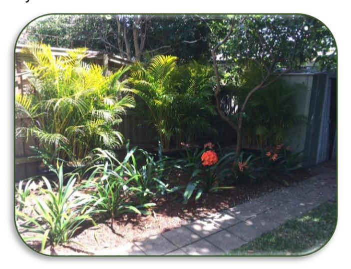
Pruned, weeded + mulched. Rented Golden Cane hedges + planted Cliveas