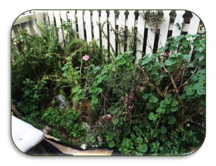
DRIVEWAY GARDEN BEDS