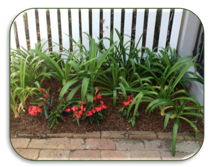
Clear & tidy + planting of Agapanthus & Red Begonias After: