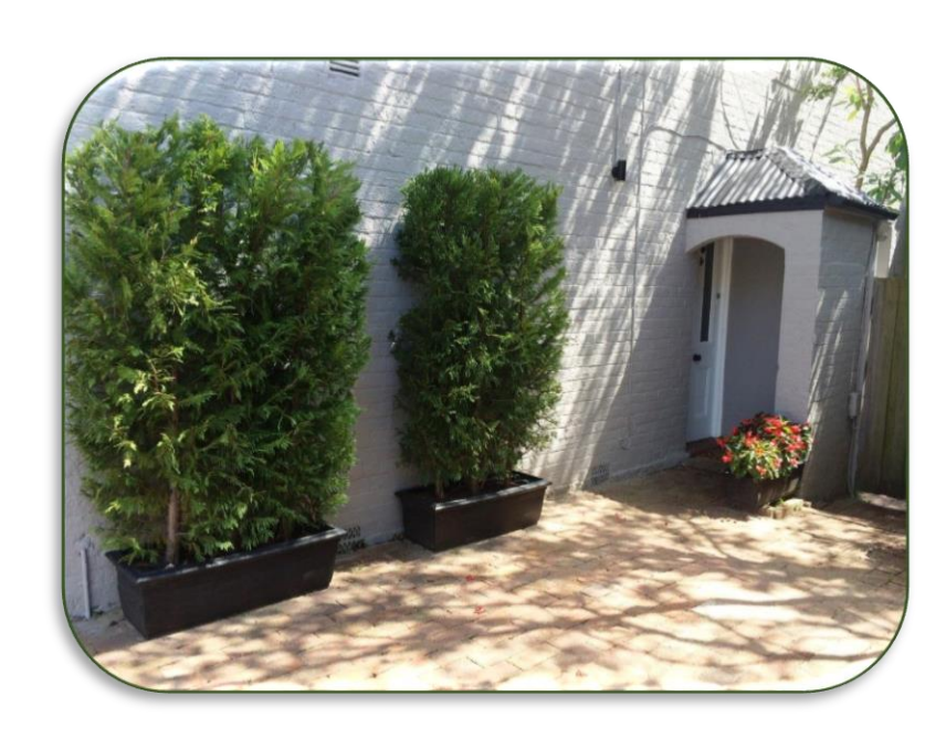
Rented Red Begonia hedges & Conifer hedges