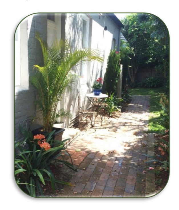
Cleared, weeded & mulched + Rented Golden Cane palm + planted Cliveas