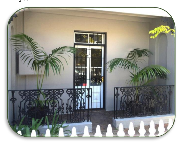
Rented Kentia palms